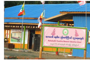
Before; 4 photos below, After