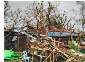
Sai Aung Main/AFP