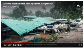
<cbc.ca> Video, Click to watch

On May 14, 2023, Cyclone Mocha, the strongest cyclone in the Bay of Bengal in 20 years struck Rakhine State in Myanmar with sustained winds up to 250 kph (155 mph).