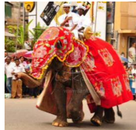
Elephant in Esala Perahera