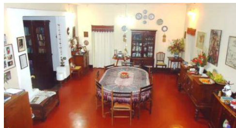
HPH Dining Room

manner and guests, without exception, have found the methods employed fascinating and worthy of observation and some participation as well.