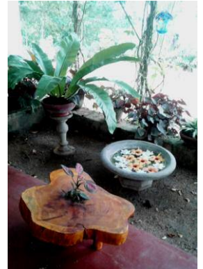
Jak burlwood table at entry to HPH