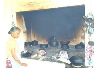
Cooking on our open-hearth