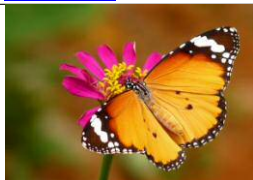
Plain Tiger ( Danaus chrysippus )