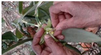
Hand-pollinating vanilla blossom