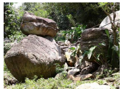
The beginning of Boulder Path