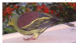
Pompadour Green Pigeon