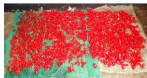
Mace, the second spice from the Nutmeg tree