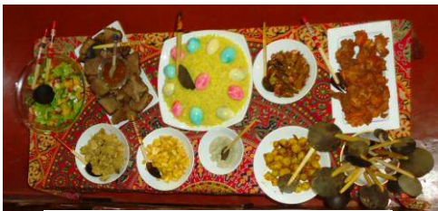
Typical HPH Planter's Lunch

Most of the time, the hives of the fierce Giant Rock Bees of Sri Lanka are on the huge trees that dwarf the rest of the vegetation. Among the latter are the pepper vine- and vanilla-carrying Gliricidias , the clove and nutmeg trees and the cinnamon bushes. The thirty-odd varieties of tropical fruit that are a part of HPH's cuisine in either fresh or preserved form are scattered through the land one traverses. Almost the entirety of our Sri Lankan cuisine is cooked on an open hearth in clay pots in traditional