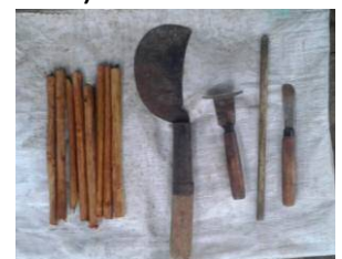
Cinnamon quills and harvesting tools