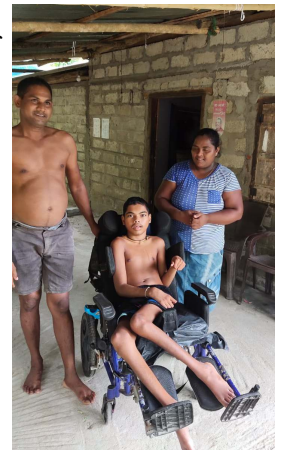
This special wheelchair was ordered from Colombo and donated to this boy.

The economic crisis in Sri Lanka continues unabated. Shortages of food, medicine, and fuel have caused many businesses to close, and many people have lost their jobs. Since the beginning of the year about 3000 doctors have left the country. Relief funds are still greatly needed.