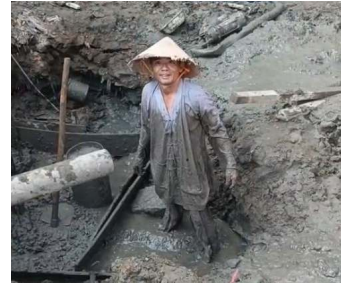
Click this photo to watch a short video of our student, working on the construction in the mud.

Work continues at this nunnery in Vietnam. Our student has taken a break from her studies at University of Peradeniya for more than one month to assist her mother and aunt in the construction of a residence hall. When completed, the compound will provide a safe haven for abused women, as well as a source of fresh fruit for the village. The donations we received were a great help, but much more is needed. The cost of building materials is steadily increasing. Buddhist Relief Mission would like to help speed the construction so that our student can return to her studies in Peradeniya. We invite all of our supporters to join in this meritorious project.