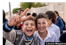
These Rohingya refugees were rescued by the SL Navy and have been held for almost two years in a military base in Mullaitivu.