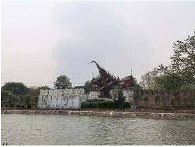
Pyaye Phyo / Facebook