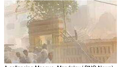
A collapsing Mosque, Mandalay / BNO News)