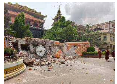
Masoyein Monastery after collapsing