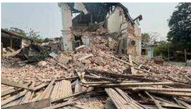
Naypyitaw / Aung Shine Oo / AP