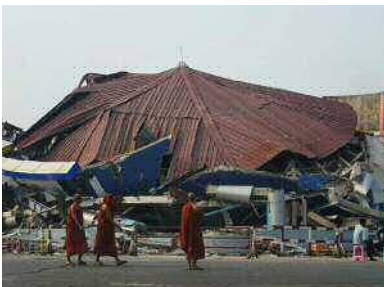
Naypyitaw / Aung Shine Oo / AP