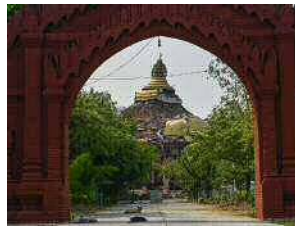
Mandalay / Sai Aung Main / AFP via Getty Images