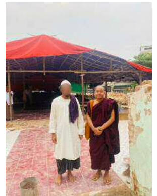
This 33-second video (available via Facebook), showing the damage to a mosque and a donation for the reconstruction, has a soundtrack of Burmese music.