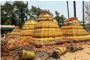
Naypyitaw / Aung Shine Oo / AP