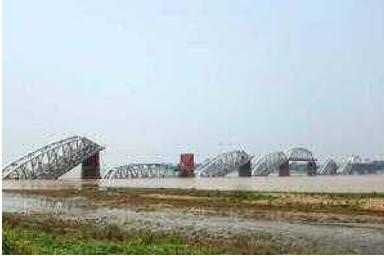
The collapsed Ava Bridge in Mandalay