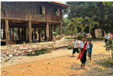
Naypyitaw / Aung Shine Oo / AP