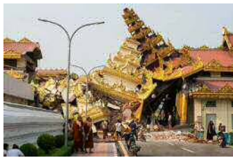
The collapsed Maha Myat Muni Pagoda in Mandalay