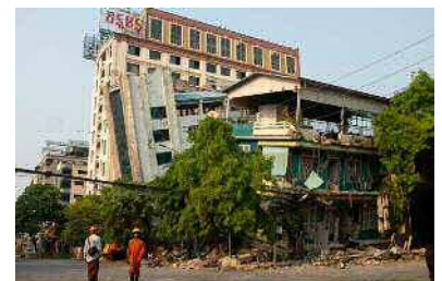
Mandalay / EPA-EFE