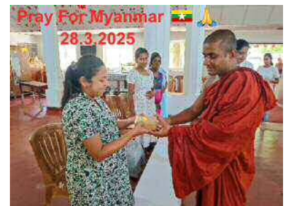
Click this photo to watch a video of relief being distributed to earthquake victims