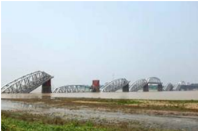
The collapsed Ava Bridge in Mandalay