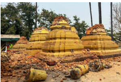
Naypyitaw / Aung Shine Oo / AP