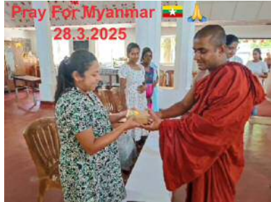
Click this photo to watch a video of relief being distributed to earthquake victims