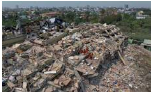
An apartment complex in Mandalay