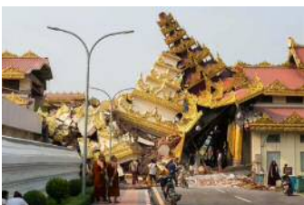
The collapsed Maha Myat Muni Pagoda in Mandalay