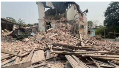
Naypyitaw / Aung Shine Oo / AP