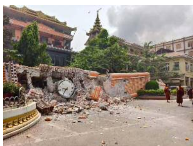
Masoyein Monastery after collapsing

Click the image below to watch a graphic video of Masoyein Monastery collapsing