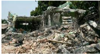
A hotel in Sagaing

Myanmar is still recovering from the devastating earthquake of March 28, 2025. The cities most severely hit were Sagaing and Mandalay, but the damage and hardships are widespread..