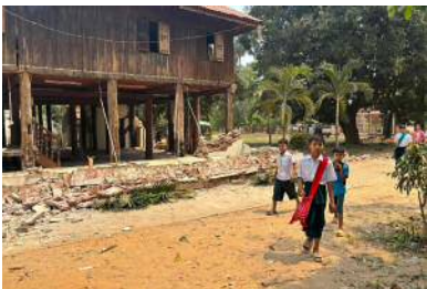
Naypyitaw / Aung Shine Oo / AP