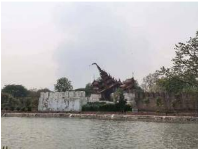
Pyaye Phyto / Facebook