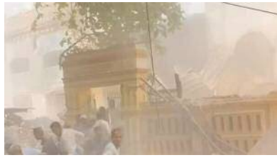
A collapsing Mosque, Mandalay