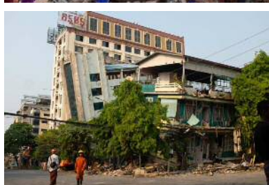
Mandalay / EPA-EFE