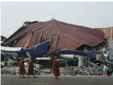
Naypyitaw / Aung Shine Oo / AP